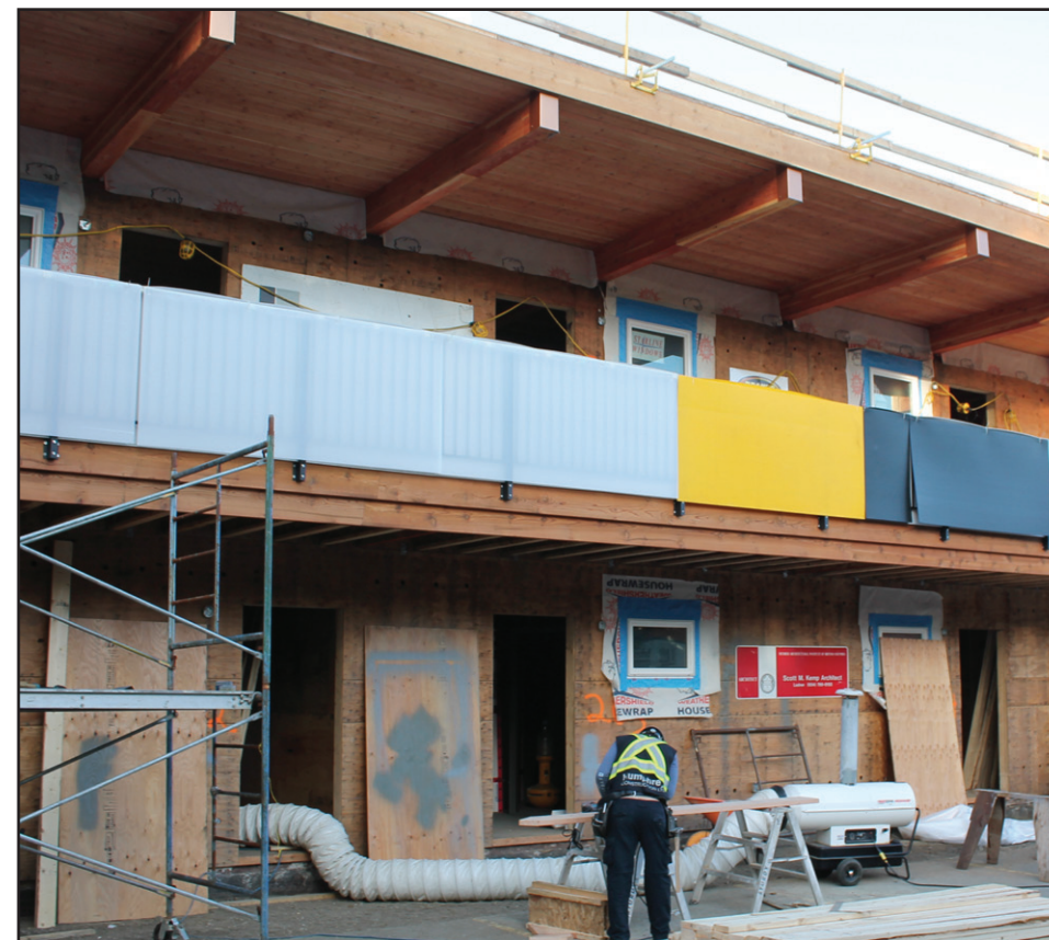
Construction of the Thornton Motel is moving along and is expected to be open in time for the busy summer season.

Along with the re-construction funds will also be needed to buy new furniture and other upgrades such as a laundry facilities upgrade is being discussed now that the Motel is taking care of the laundry for the Wya Point Resort too.