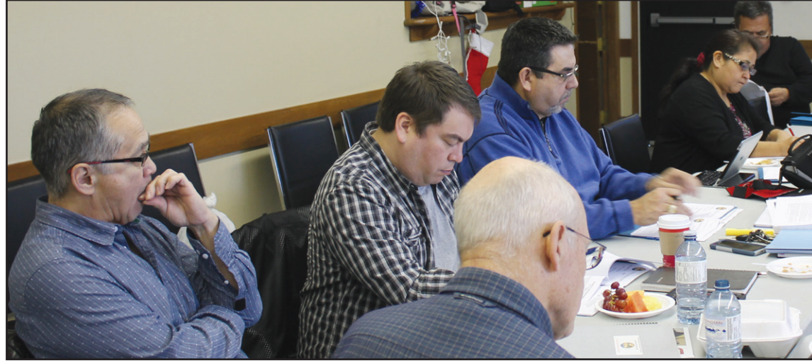
The Yuulu?i?ath Legislature members attend the Maanulth AGM on December 4, 2015

Toquaht set trees throughout Loudon and Newcombe Channel but were not successful in getting herring spawn on boughs. Continued on page 11.