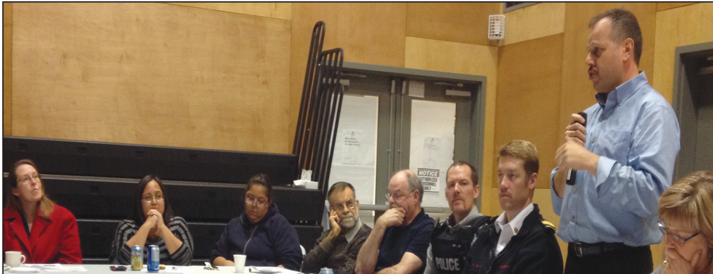
Emergency personell from Hitacu, Ucluelet, Tofino, Ahousaht and Tla-o-qui-aht and representatives from the Coast Guard attended a meeting to debrief the boating tragedy in Tofino.

There was some discussion about the importance of local knowledge of water ways and common names for areas that may not be listed on marine charts. The group will reconvene in the new year to do a joint table top marine rescue exercise.