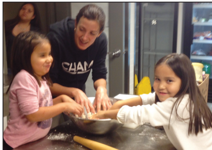
Hitacu youth had a couple of cookie making sessions and a card making session to make goodies for local Elders. The chocolate making was a wee bit messy.

Nations who are part of the Maa-nulth Treaty Society will be featured in the January Umacuk.