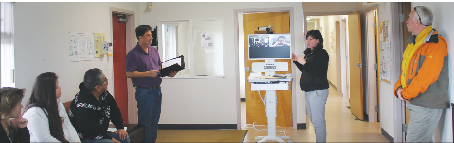
Community health workers and some YG staff and Legislature members got a sneak peek at the new Telehealth system that will be operational at the Hitacu Health Centre in January. There will be a public demonstration for the community at the January 14th culture night.