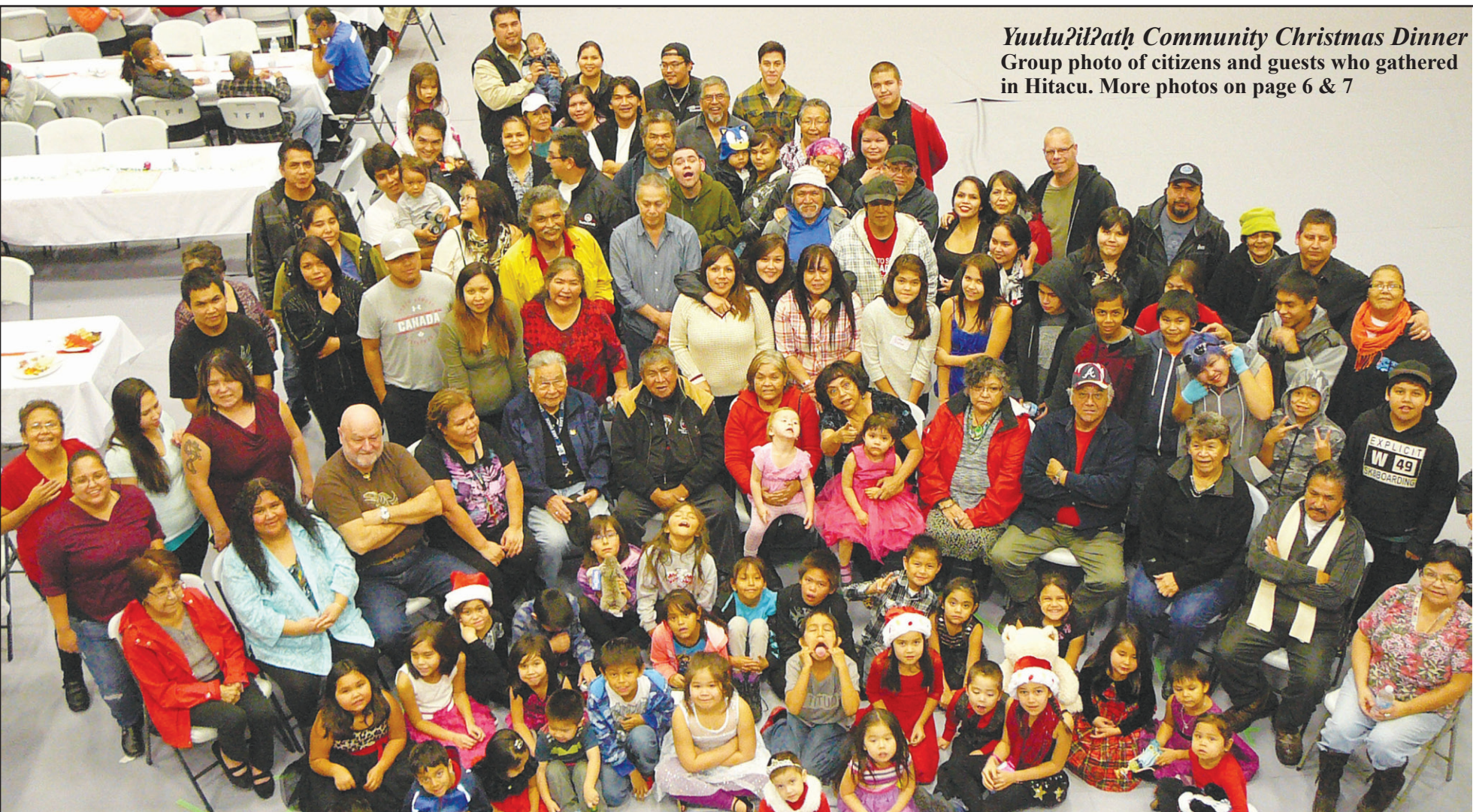
Yuutu?it?ath Community Christmas Dinner Group photo of citizens and guests who gathered in Hitacu. More photos on page 6 & 7